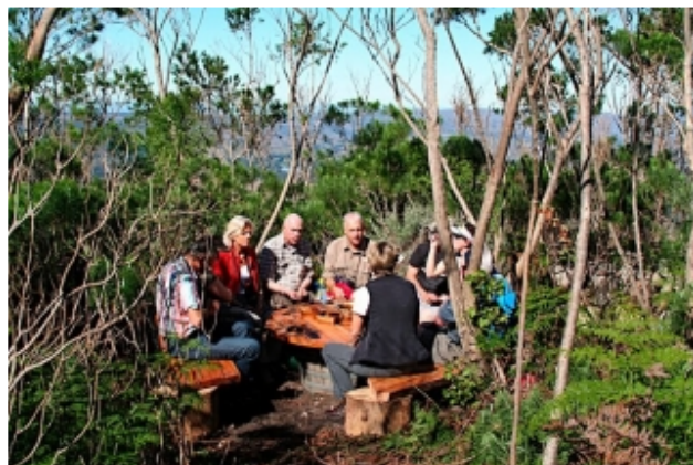
Paul Cluver has its own ampitheatre and organizes bush hikes too.

(Just to confuse you, the way to get to Paul's is to turn LEFT when you reach the N2 from Theewaterskloof rather than RIGHT to go back to Cape Town. Follow the signs for N2 Caledon and you should be fine.)