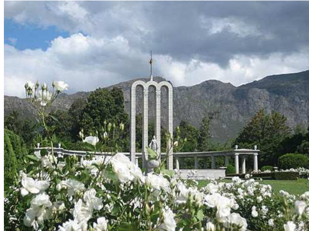
Sunset over the vineyards and the Huguenot Memorial in Franschoek

Once a sleepy little town in the winelands, Franschoek was discovered by wealthy Capetonian émigrés about twenty years ago. Property prices in the old town went through the roof and now, Franschoek is a very pretty and up market town surrounded by stunning scenery and agri/viti culture. From its name and those of the surrounding farms you'll be able to tell that this is a very French part of South Africa, so expect excellent food and wine along with a very proud cultural history. If you thought house prices were bad in Camps Bay, think again for the price of a two bed cottage here!